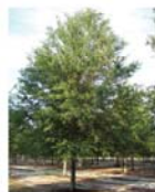
SOUTHERN LIVE OAK